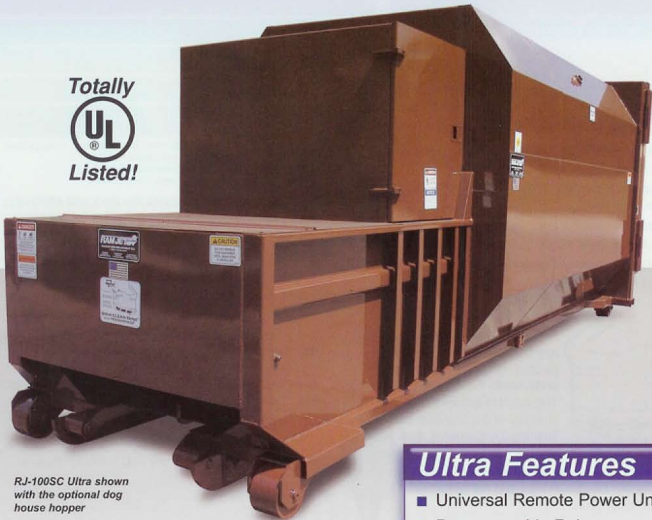
RJ-100SC Ultra shown with the optional dog house hopper