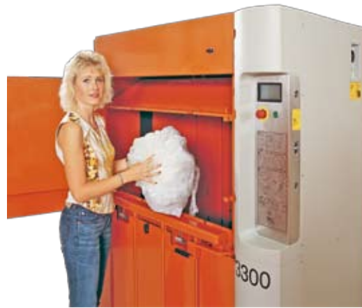
Different types of materials, such as paper or plastics, are easily loaded and compacted.

Orwak 3300 is the result of over 30 years of experience in the market. It is safe and reliable for the operator and fast and powerful for efficient operation. Orwak 3300 is easy to handle.